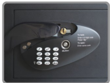
Emergent power supply and mechanical key override in case batteries or safe fail