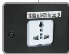
Internal power outlet options on inside door