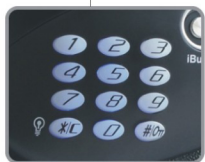
ADA compliant illuminated keypad